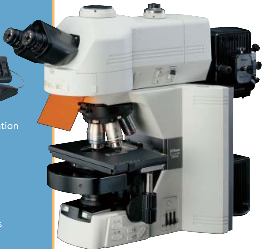
90i with D-DH-E Motorized Digital Imaging Head